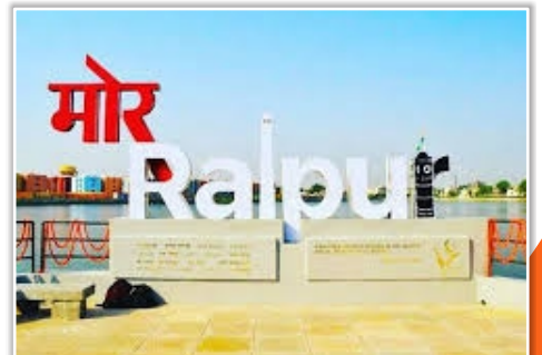
Marine Drive, Raipur 4.0 KM