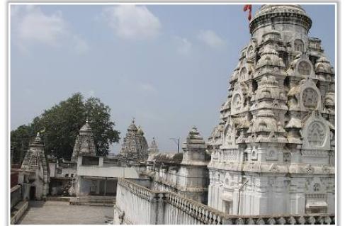
Shree Rajiv Lochan Temple 48.7 KM