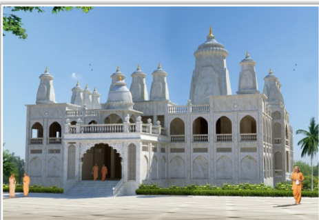
Iscon Temple, Raipur 11.1 KM