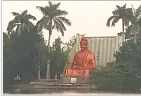
Budha Talab 2.7 KM