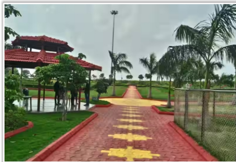
Naya Raipur Central Park 25.3 KM