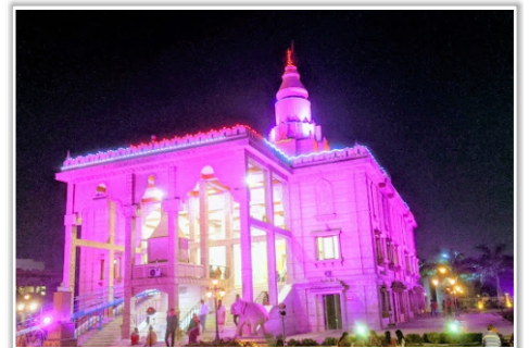
Ram Mandir, Raipur 4.1 KM