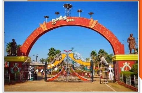
Muktangan 21.7 KM