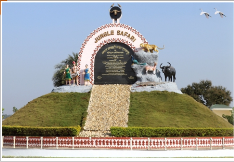
Jungle Safari 27.8 KM