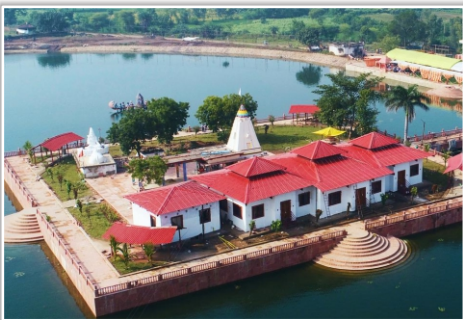
Kaushalya Mata Mandir 27.7 KM