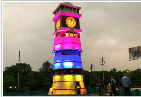
Ghadi Chowk, Raipur 3.0 KM